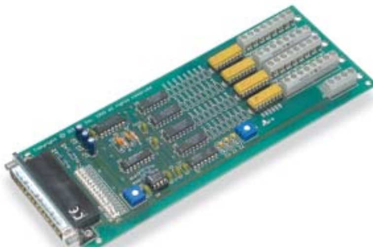
The DBK15 provides 16 channels of current or voltage input

The voltage and current input ranges shown in the accompanying charts supply a full-span signal to the A/D converter, providing maximum measurement resolution.